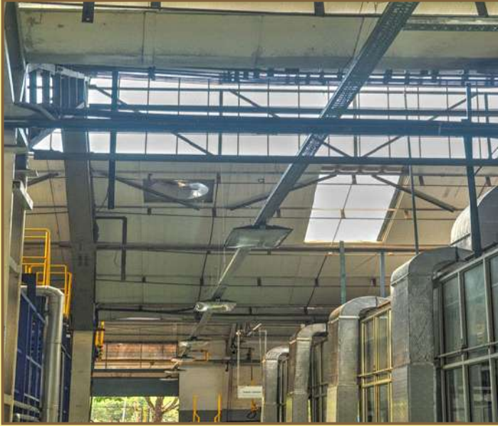
Routing of Cable Tray for Mounting of Lighting Fixtures