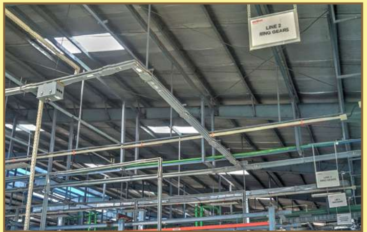
Installation & Commissioning of Sandwich type Bus Bar Duct