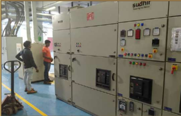
Installation & Commissioning of Main LT Panel