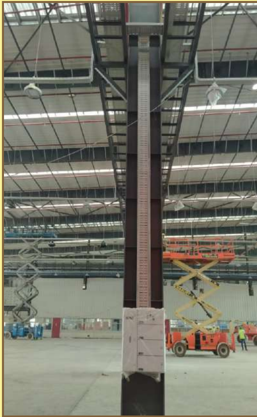
Routing of Cable Trays