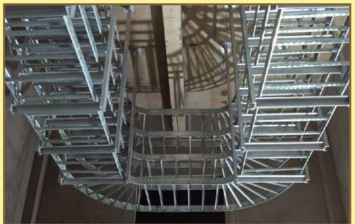
Routing of Cable Trays