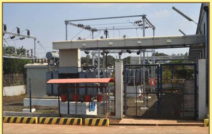
Routing of 33kva Bus Duct