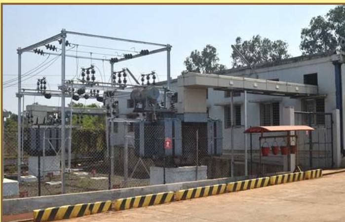
Routing of 33kva Bus Duct