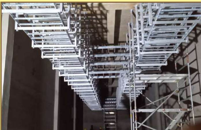
Routing of Cable Trays