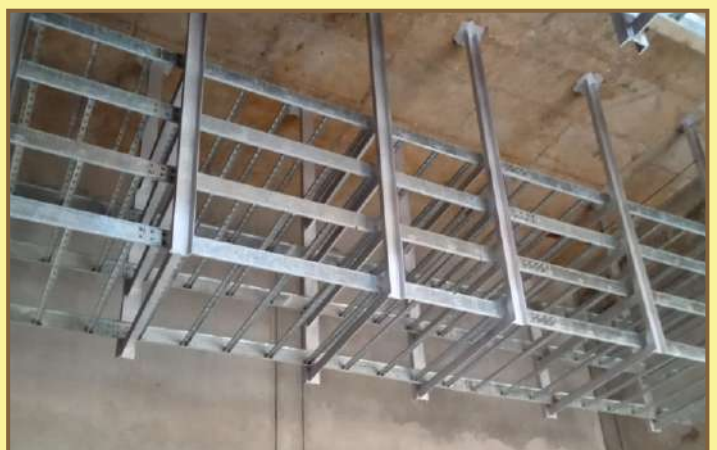
Routing of Cable Trays