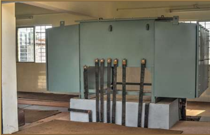
Installation & Commisioning of 33 KVA cubicle metering