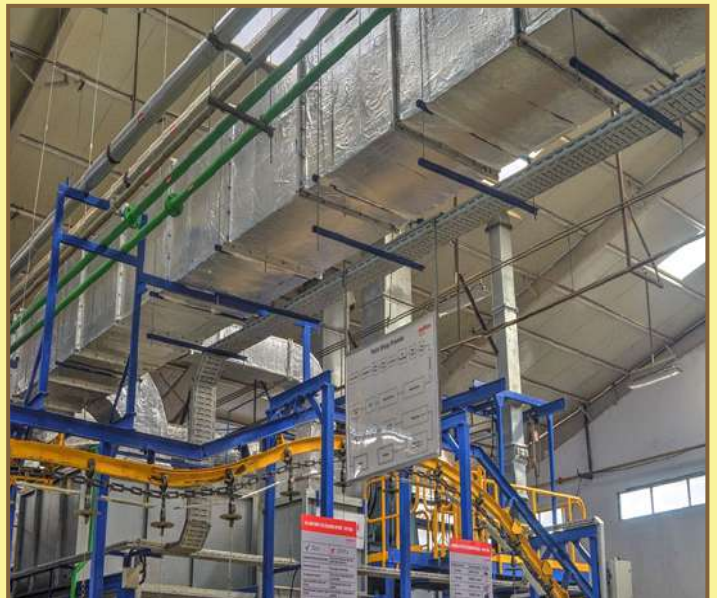
Routing of Cable Tray