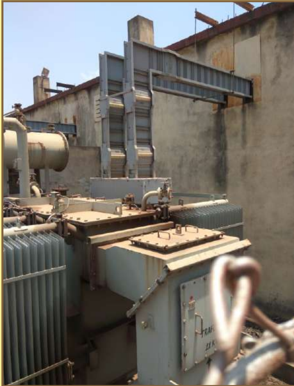
Installation & Commissioning of 2500 x 2 Sandwich type Bus Duct