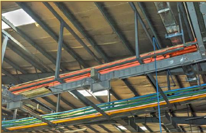
Installation & Commissioning of Sandwich type Bus Bar Duct