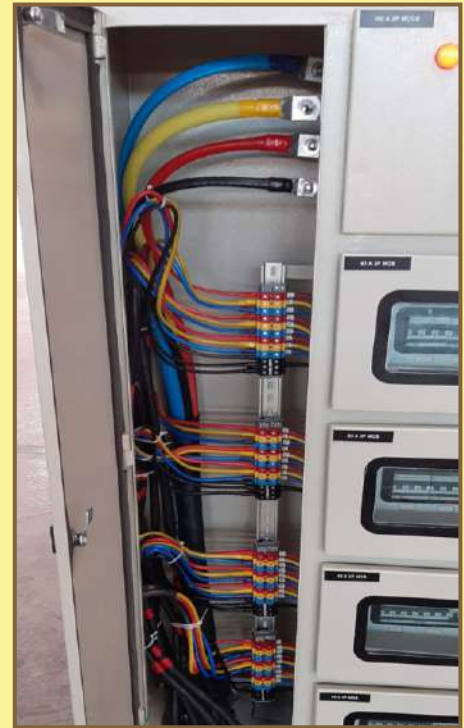
Termination of Panel