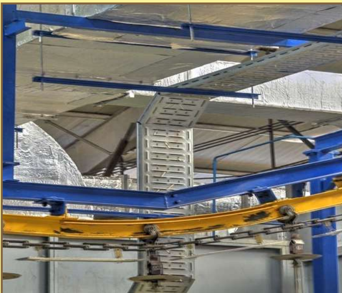
Routing of Cable Tray