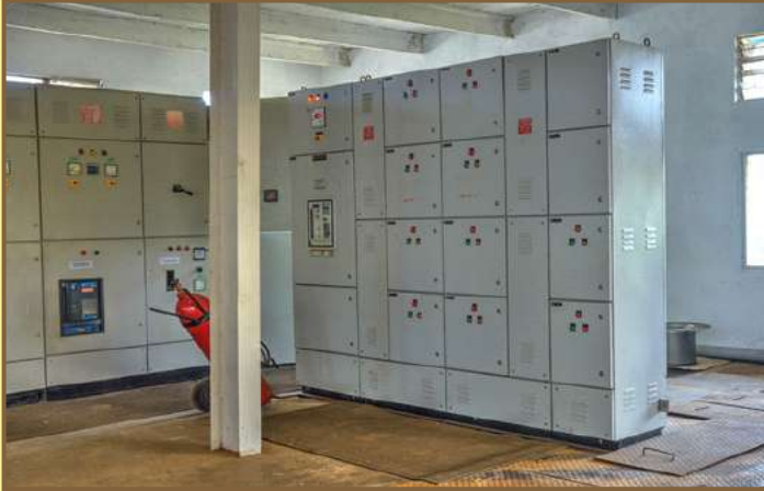
Installation & Commissioning of Capacitor Bank Panel