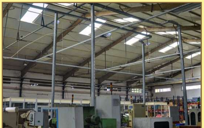
Routing of Cable Tray for Individual Machines