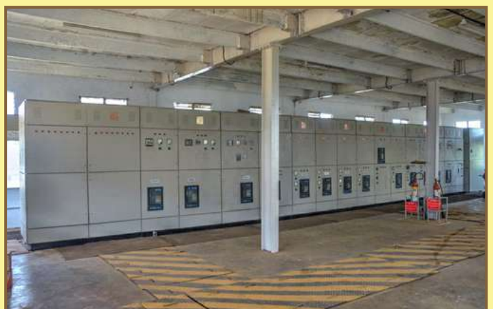
Installation & Commisioning of LT Panel